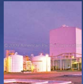
Cedar City, UT