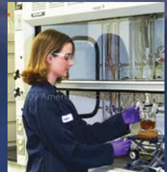
Rancho Cordova, CA