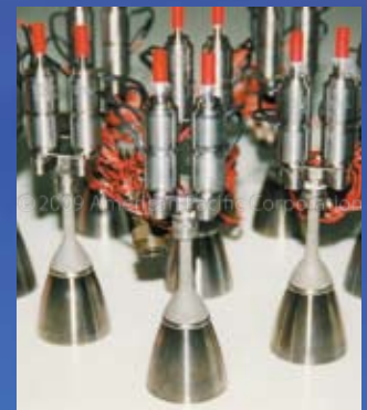
U.S., U.K. & Ireland