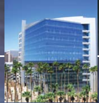
Las Vegas, NV

Water Treatment - PEPCON® Systems designs, manufactures and services electrochemical hypochlorite generation systems for use in water disinfection throughout the world.